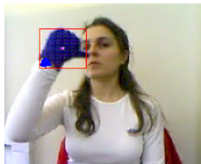
Figure 3 The gesture for "I am thirsty"

Sign Language (TSL), the selected signs are symbolic and intuitive; thus easy to learn and imitate for any patient, and not necessarily a TSL signer (Figure 3).